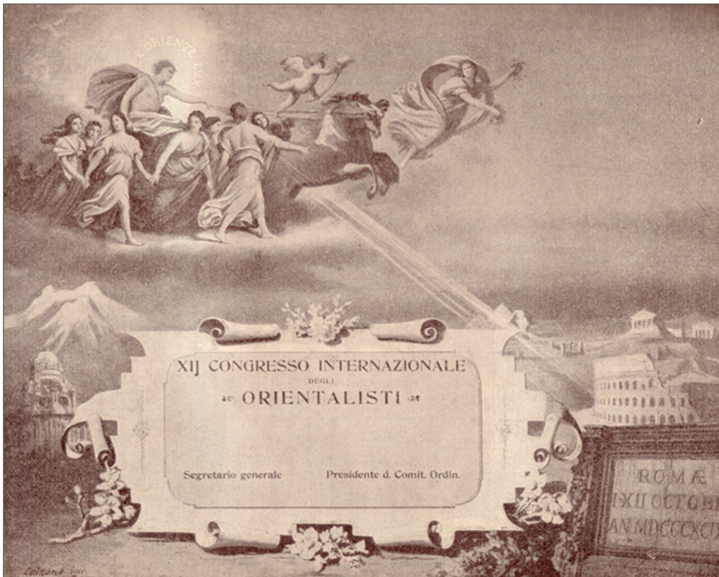
Fig 1: Poster from vol.1 of the Proceedings of the XII International Congress of Orientalists. The Congress, originally scheduled from 1-12 October, was inaugurated on 4th October with an opening message from King Umberto I of Italy, delivered by Guido Baccelli, Minister for Education, and concluded on 15th October with a farewell banquet. (Notice Ex Oriente Lux (Light comes from the East) in the aureole of the coach driver). A copy of the Rome Proceedings is stored in the Library of the School of Oriental and African Studies (SOAS) in London.

The next message was delivered in French by Count Angelo de Gubernatis (2) [foot2] , President of the organising committee: (3) [foot2]